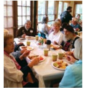
Great times at the Neighbors-In-Deed BBQ at Wilson Pond

For example from our America Reads survey to teachers in June, "My volunteer provides invaluable one on one instruction to students who are struggling academically. It is very important that these students receive some one on one instruction. It helps them learn in a focused manner, and gives them much needed practice reading orally. There is very little time in a classroom for one on one instruction, and it does not always happen at home. My volunteer fills that void." At our Neighbors-In-Deed barbecue, one care recipient said tearily, "I so often don't get out of the house. I am so happy to be here. Thank you for doing this for us."